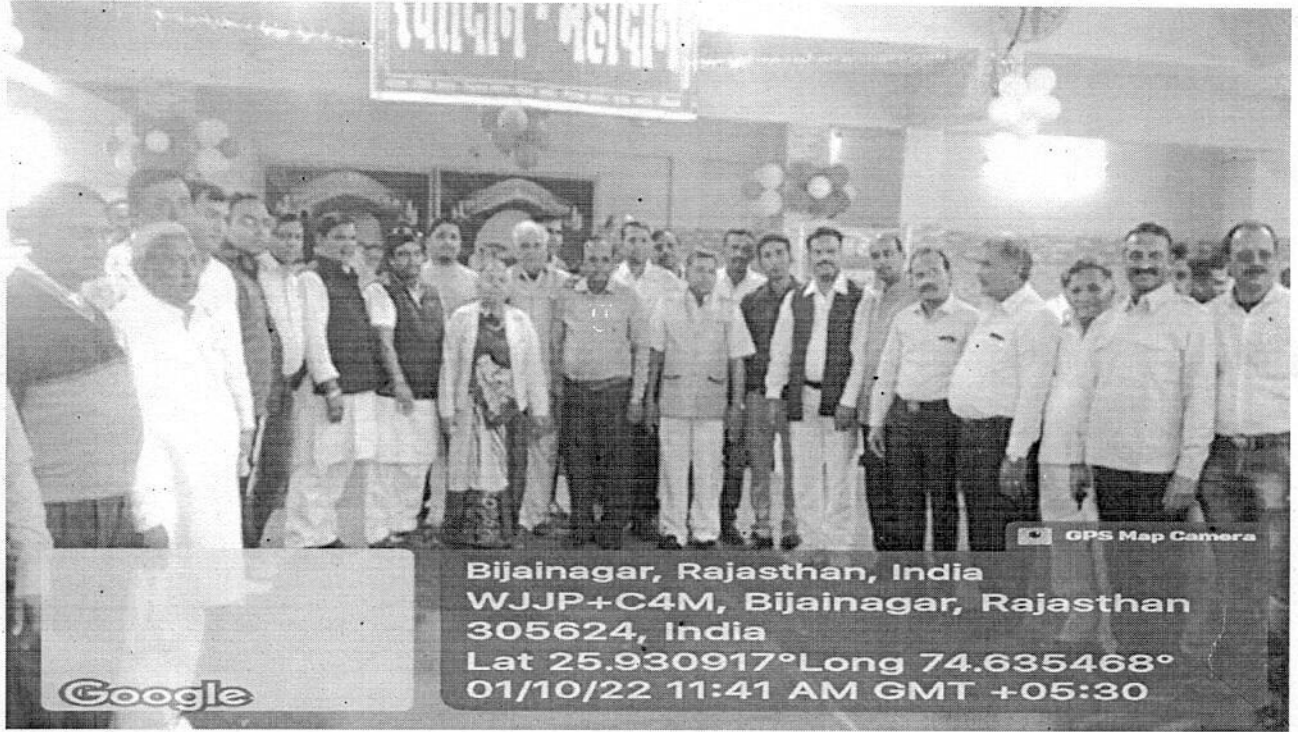
Figure 1: Members of Pragya Jain Yuva Mandal at Blood Donation Camp

Director Shri Pragya Mahavidyalaya Bijainagar-305624